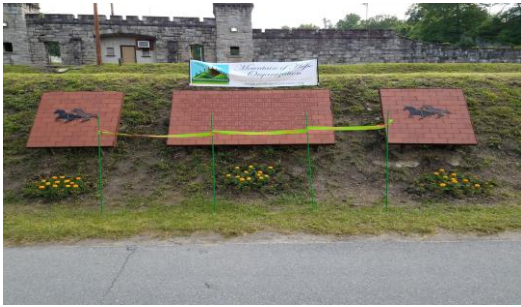
Mustang for Life!